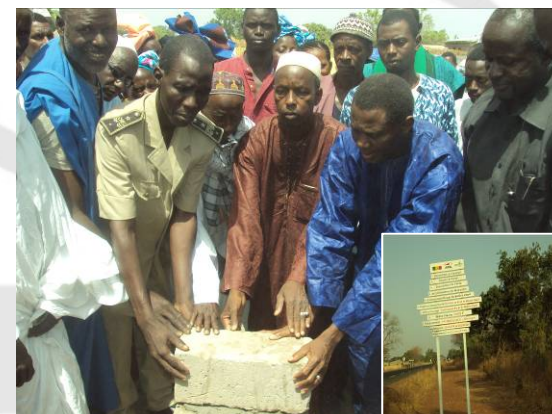
Groundbreaking for FAI Clinic

With the building of the hospital not only the medical care of the people should be safeguarded, but also their future. Already now the construction of the clinic ensures to improve the quality of life, since for the construction of the hospital indigenous people are employed. Even later, there should work a lot of residents in the clinic and the related environment to give them a new perspective on their life and a secure future. People will be taught in medical and hygienic principles so that their quality of life and the care of their patients is secured.