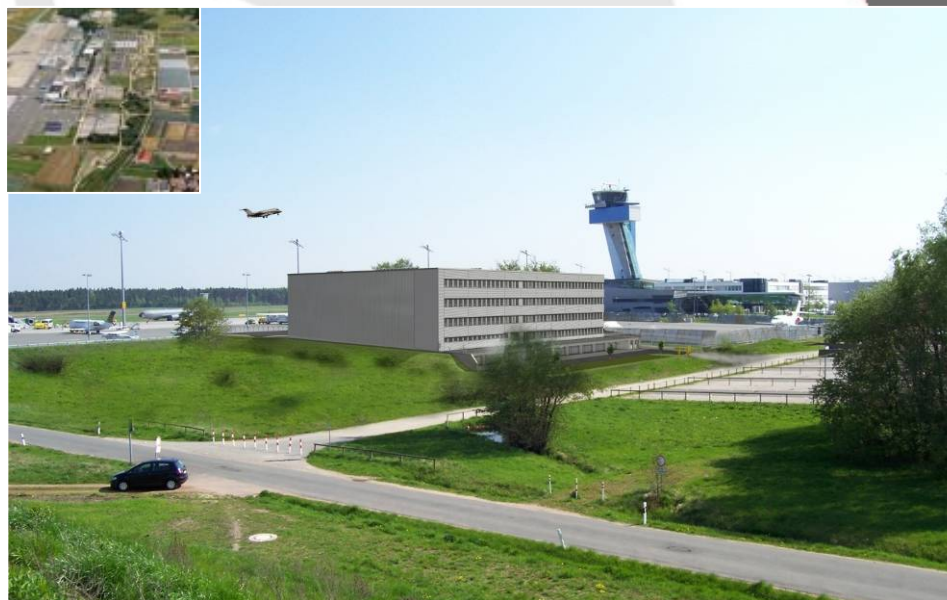
Rendering of FAI's new Hangar and Office Building

A 100 kwp roof top solar power plant is ensuring carbon neutral office- and hangar operations, which is the first project of it´s kind at a German Airport.