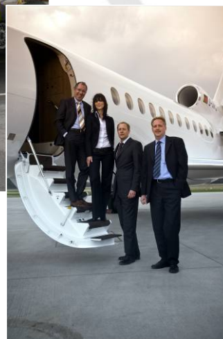
FAI's Board of Directors