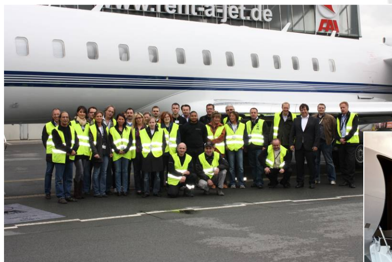
FAI's ground staff gathering in front of FAI's Global Express

FAI rent-a-jet AG is operating globally for more than 20 years, employing more than 120 people From 20 different countries.